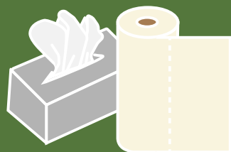
Tissues & Paper Towels