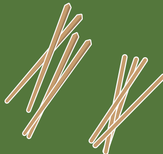
Wooden Stirrers & Chopsticks