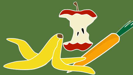
Vegetables & Fruits