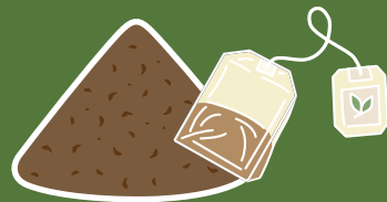
Coffee Grounds & Tea Bags