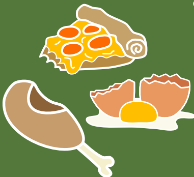
Meat, Egg Shells, & Dairy